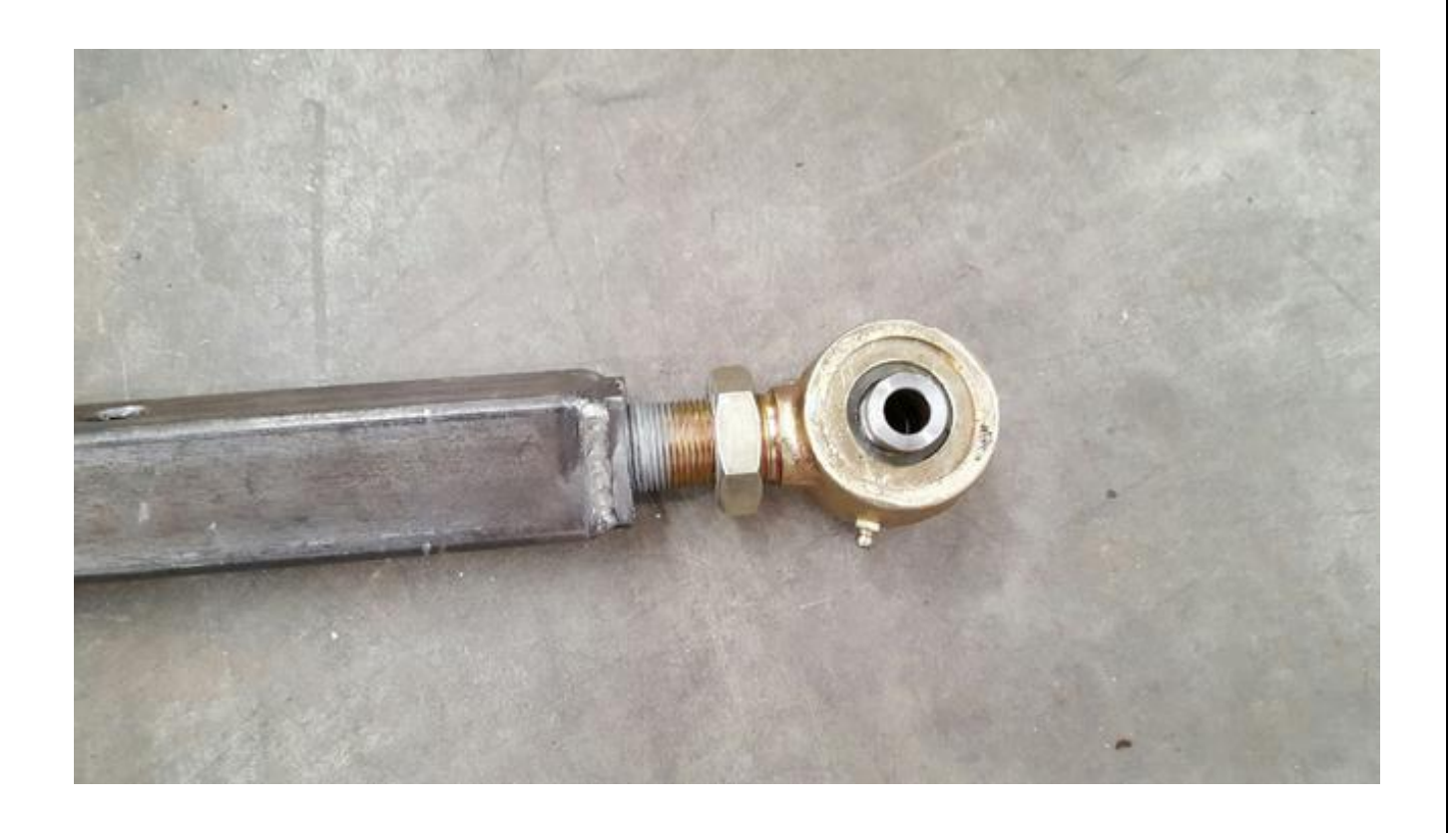
*SET APPROX 1" OF THREAD EXPOSED ON THE ADJUSTER* *USE ANTI-SIEZE ON THE THREADS*

The new trailing arms go in next. The trailing arms are adjustable in length. This adjustment is used to set the wheelbase and to square the axle in the chassis. In the long run you may drop the arms a few times to get it perfect. No big deal, it's like carb jetting, with really big parts. The arms bolt in just like stock with new hardware provided up front. Use anti-seize on the threads, and the OE U-bolts for mounting the axle.